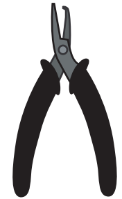
Split Ring Pliers

Place the "L" in between the rings to open